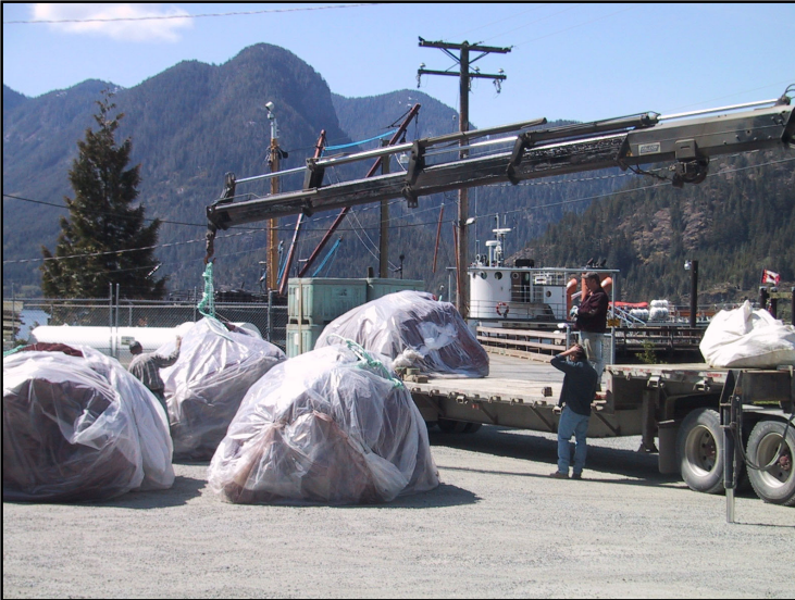
MV Uchuck made an extra mid-week stop recently, carrying extra freight to fish farms down the inlet in anticipation of their annual 2-week refit. The vessel should be back on the regular run this coming week.