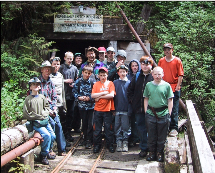
Both leaders and scouts enjoyed a tour of the Privateer Mine to wrap up their long weekend adventure, locating 50°N 127°W.