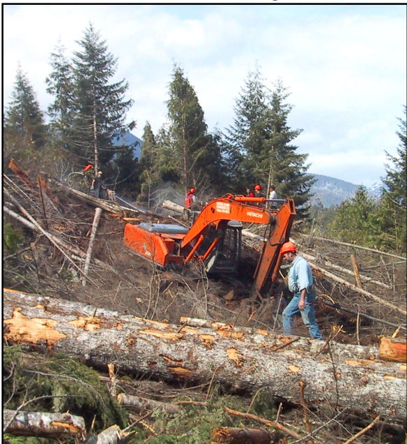
In what turned out to be more smoke than fire, volunteers quickly extinguished a brush fire that sprang up in the slash at the site of the Ehat's playground clearing last week. See story on Page 4.